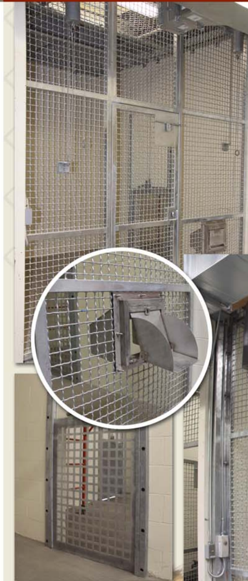
Lion. 2x2 woven square mesh, 1/4 inch round steel stock, with detail of feeder hopper and shift door.

We are in full compliance with all installation requirements. CCB#151161