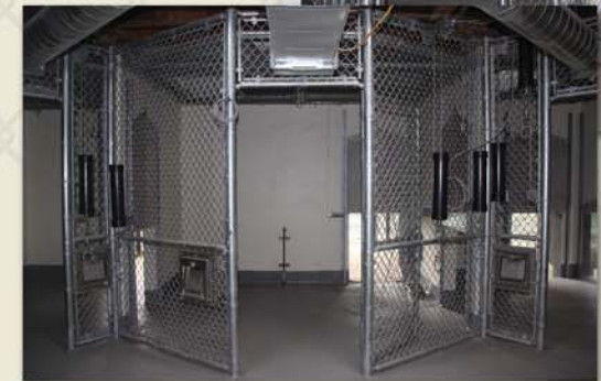
Cheetah. 2 inch diamond mesh, 6 gauge, with detail of shift doors and counter weight system.

Moreover, the people at Portland Fence Co. require no babysitting. They review the master plans, criteria and specifications. They know what to do; they come in and do it. It's that simple.